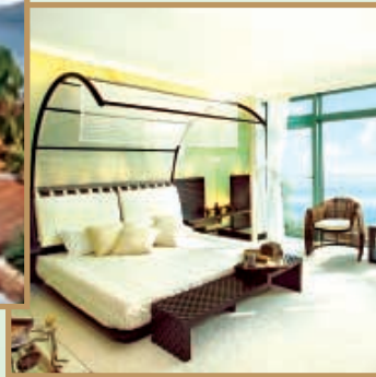
Lively Contemporary Thai styled house. 清新脫俗的時尚泰式擺設家居。