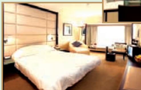
Renovated suites and guestrooms on Regal Club Executive Floor, well-appointed and gracefully furnished.