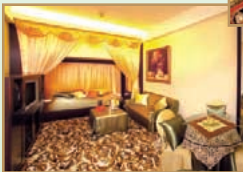
Theme suites decorated with different country themes being well received by hotel guests. 主題套房配以不同國家風情，深受酒店顧客歡迎。