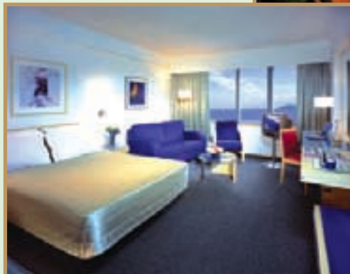
Spacious suites and guestrooms, well furnished and delicately planned. 套房及客房佈置優美，設置細意安排，空間寬敞。