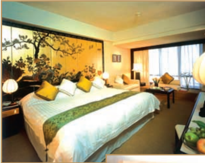
Deluxe room refurbished and filled with oriental culture. 客房裝修華麗，充滿東方文化氣色。