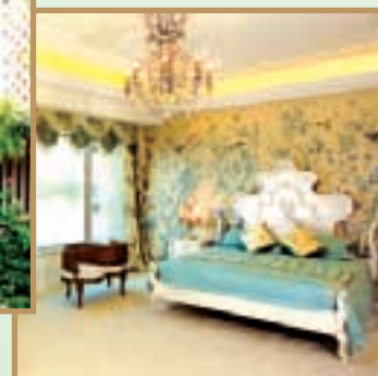
House decorated with English Country style. 英國鄉郊式之華麗佈置。