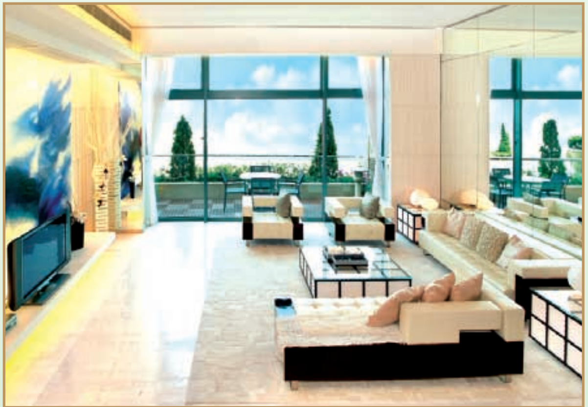
Elegant Contemporary Japanese styled house. 時尚日式設計，簡潔舒適。