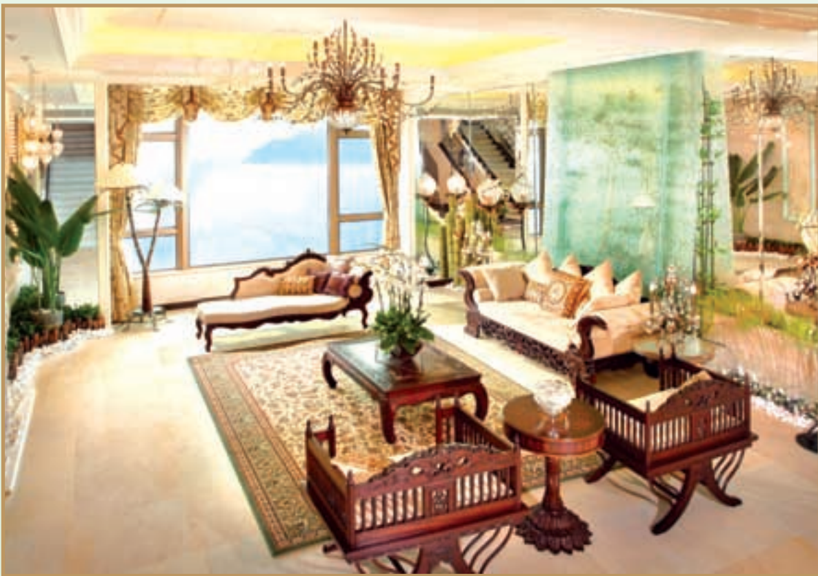
House full of Oriental Romance . 全屋充滿東方浪漫色彩。