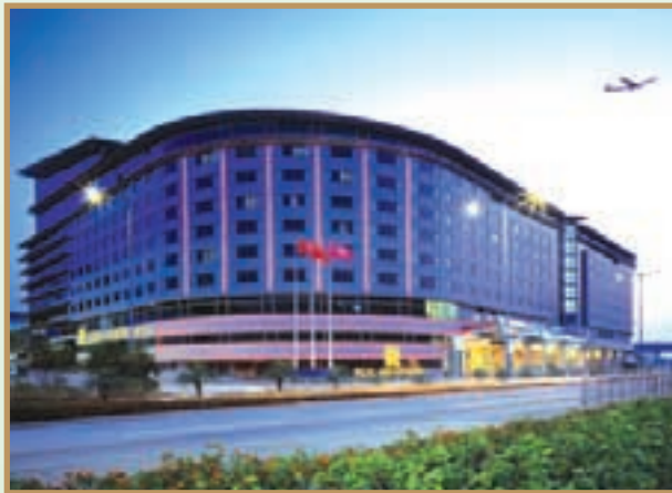
The 1,000 square meter pillarless Grand Ballroom is the largest hotel ballroom in Hong Kong. 面積達1,000平方米之無柱式大宴會廳乃香港最大型之酒店宴會廳。